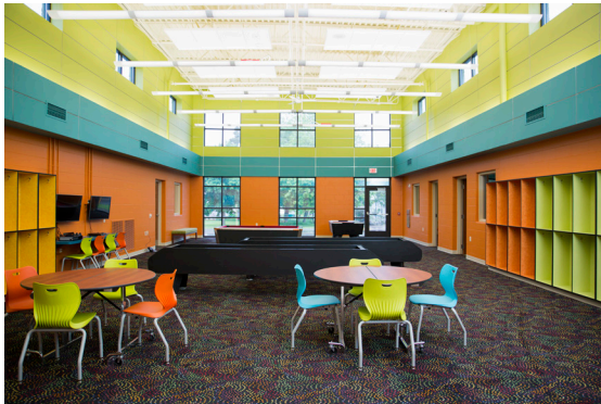
YOUTH SIDE: AGES 6-12