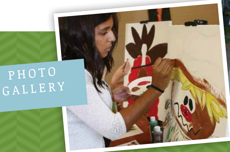
Six Club kids painted canvas' to display at The Duel.

I hope to go to college to become a Veterinarian because I really enjoy working with animals.