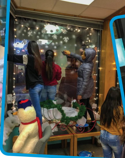
Teens decorate a local business's window as part of the city of Berlin's Window Wars.