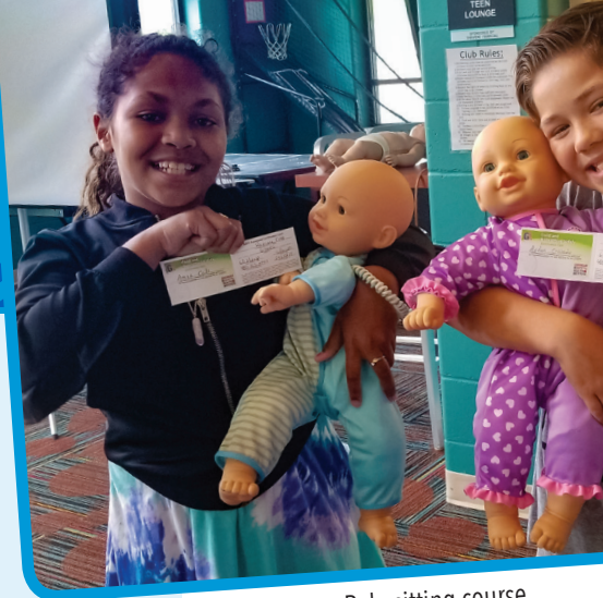
Babysitting course participants proudly show off their certifications.