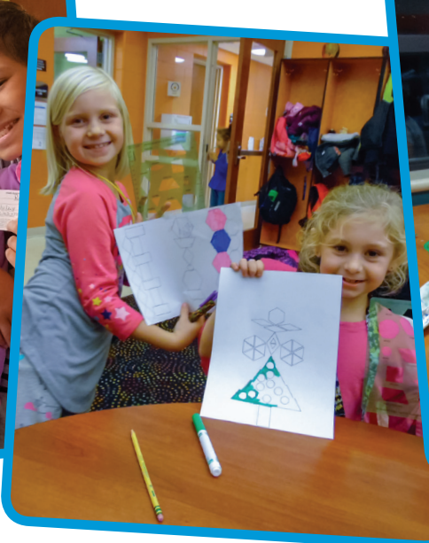
SPARKS Club members display their geometric stencil work.