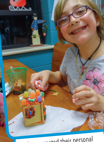
Teens created their personal gingerbread house as part of the holiday activities at the Club.