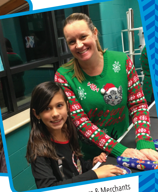
Volunteers from Farmers & Merchants Bank help Club kids wrap gifts for their family members.